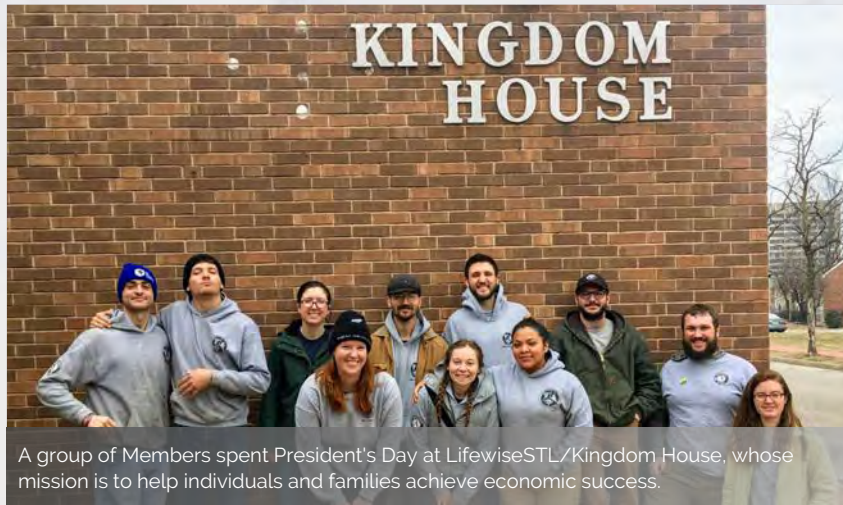
A group of Members spent President's Day at LifewiseSTL/Kingdom House, whose mission is to help individuals and families achieve economic success.

Community service and engagement is a key component of what we do here at AmeriCorps St. Louis. Our Service Day initiative aims to strengthen our presence in the community while also giving our Members more opportunities to learn about different organizations and neighbors of St. Louis.